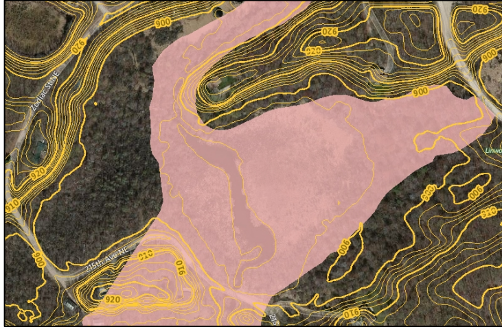
Figure 1: The mapped floodplain may not always align with on-the-ground contour elevations.